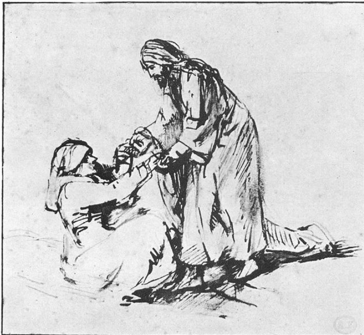
HEALING OF PETER'S MOTHER-IN-LAW, REMBRANDT

The Diocese of St. Augustine's website has posted a section called Religious Liberty Challenged at www.dosafl.com . This links directly to USCCB information on this vital issue, and has a link to the NCHLA Action Alert. Please take action if you've not already done so. Thanks for all you do in support of life!